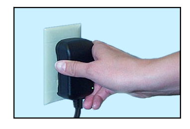
Step 3 Plug the charger into the wall