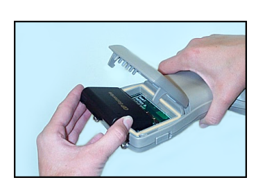
Step 1 Insert the battery pack into the Allegro