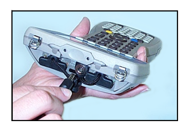
Step 4 Plug the charger into the Allegro